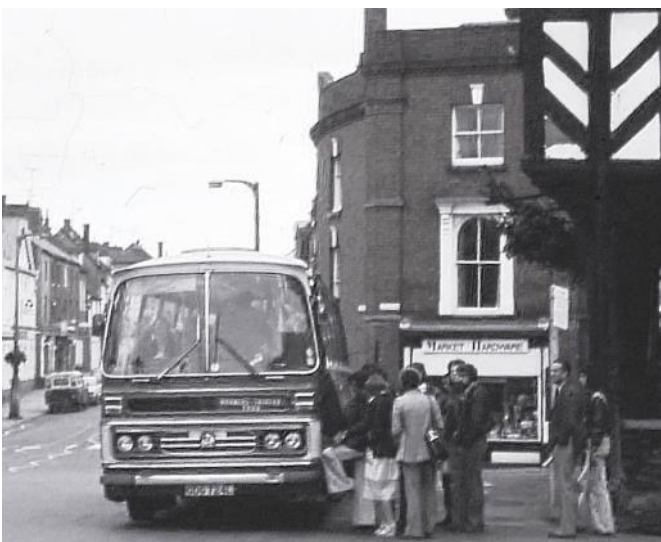
Warners Tewkesbury works service to Dowty Engineering loading at Ledbury (c. 1970s)