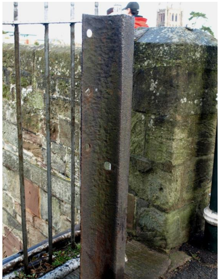
Barlow rail as used on Brunel's broad gauge railway. The rail was spiked to longitudinal timbers with steel tie bars to maintain the gauge. (Hereford old bridge)