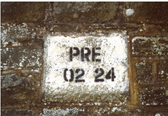
Bridge location and mileage notice (Presteigne branch railway)