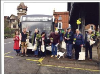
The 232 Daffodil Line service

The 2023 booklet is now available from the Tourist/Town Council Office and the Ledbury Heritage Centre, both in Church Lane, Ledbury.