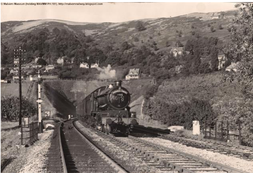
The Cathedrals Express emerges from Colwall tunnel

The Cathedrals Express will no longer serve Herefordshire. It was a named passenger express train introduced in 1957 connecting the cathedral cities of Hereford and Worcester to London Paddington and operated six days a week. Its modern equivalent leaves Hereford at 0643 and arrives London Paddington at 0936. That is until mid-May when the Great Western Railway timetable changes and the train disappears from the Hereford scene. This reduces the Hereford-London service to just three trains to London and four in reverse