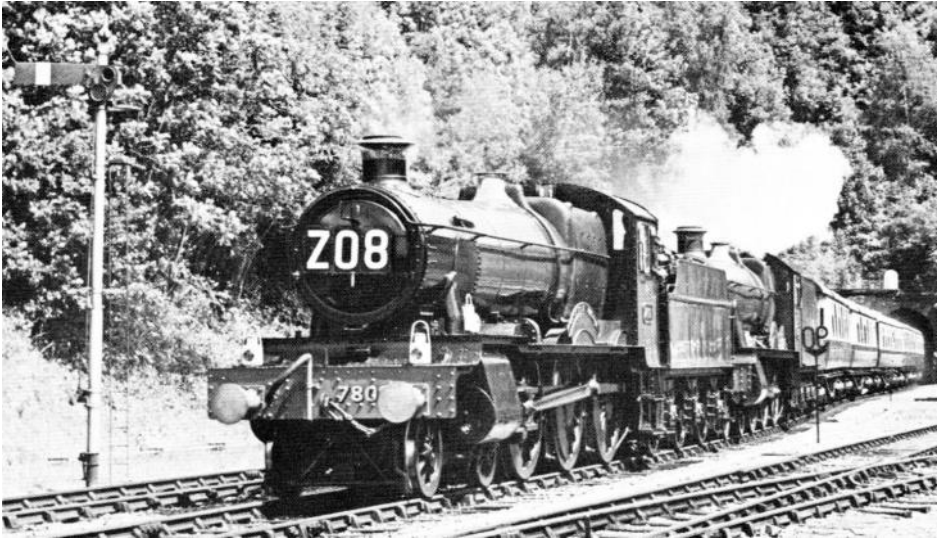
14 June 1975: Great Western Society Vintage Train: 7808 Cookham Manor and 6998 Burton Agnes Hall exiting the tunnel at Ledbury and heading towards Hereford.