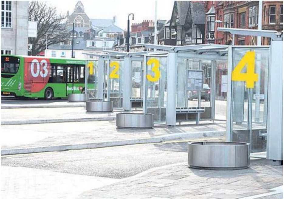
New Transport Interchange at Aberystwyth station

In October 2017 the Urban Panel from Historic England visited Hereford. In their review of what has happened in the Edgar Street Redevelopment Plan since their last visit ten year ago, they were quite outspoken: