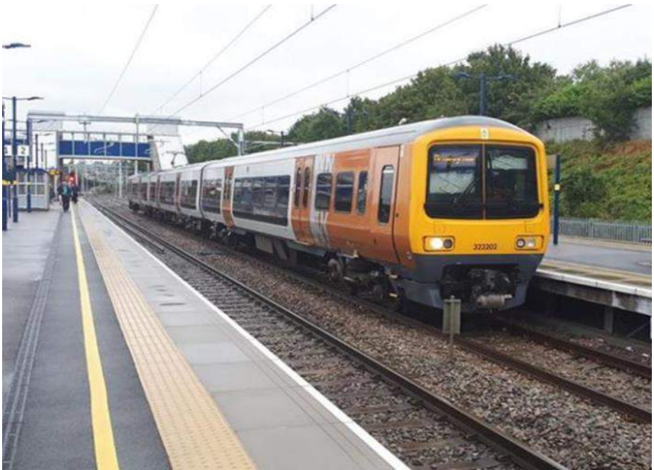
West Midlands Trains cross-city electric unit arrives at Bromsgrove

At long last the extension of the West Midlands cross city line electric service is now operational to Bromsgrove providing two electric trains per hour to/from Birmingham New Street. This is a much needed development given Bromsgrove's expansion. The Hereford-Birmingham service continues to call at Bromsgrove but it is to be hoped that the new electrics will dramatically reduce the overcrowding that occurred on Hereford trains when they provided the only service for Bromsgrove. Members that travel this line are asked to report their findings as to any continued overcrowding, especially on afternoon departures from Birmingham when some Bromsgrove residents may still find it more convenient to take up space on a Hereford train rather than use the electrics which call at all stations.