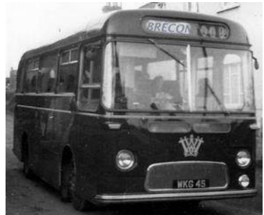
Left Above: Traws-Cymru T14 on layover at Hereford Barrs Court Station. Above Right: Western Welsh small Albion Nimbus used on rural routes out of Brecon depot in the 1960's.

Interestingly Service 39 was originally a rail replacement service started when the Hereford-Brecon railway was closed in the 1960's. The replacement bus service was then operated by the Western Welsh Omnibus company from its garage in Brecon. It was often operated with one of Western Welsh's fleet of small Albion Nimbus buses. The