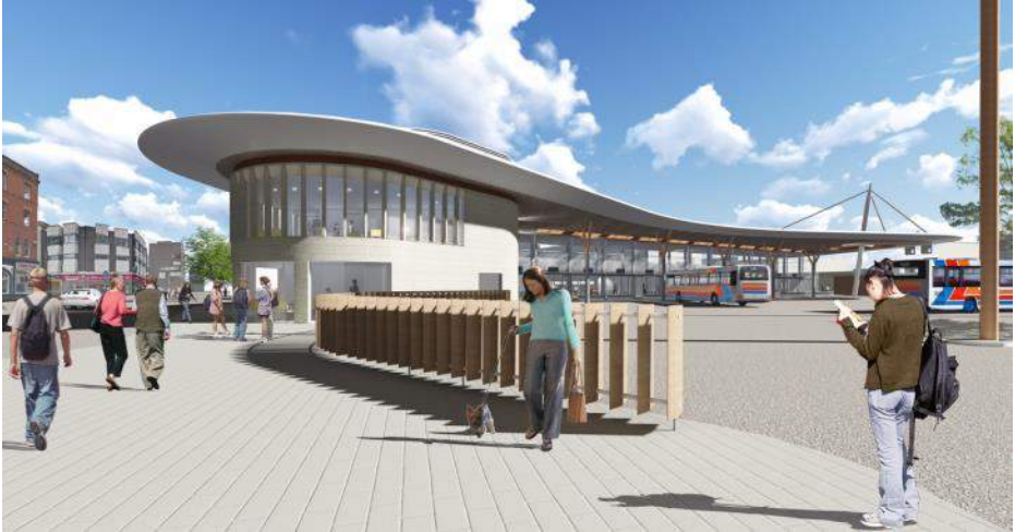
Gloucester Bus Station

promised transport interchange is that all effort is being put into the Herefordshire bypass. Taking a phrase out of the author Tom Sharpe I can truly say that Herefordshire Council is really professional at creating ‘blots on the landscape’ not only within the city but even more dramatically in the peaceful, valuable and unique Herefordshire countryside at Breinton to the west of the city.