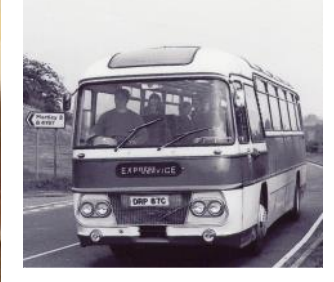
A Young DRM at the wheel.

We need Buses and Trains more than ever. Support our local services. Join Rail & Bus for Herefordshire See back page for application form