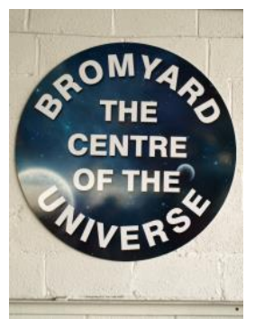
DRM's little bit of fun