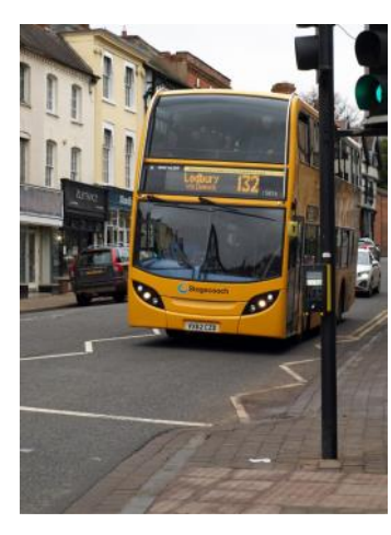
Last day of operation of Stagecoach service 132.

You may recall that we reported the withdrawal of the Stagecoach bus from Newent to